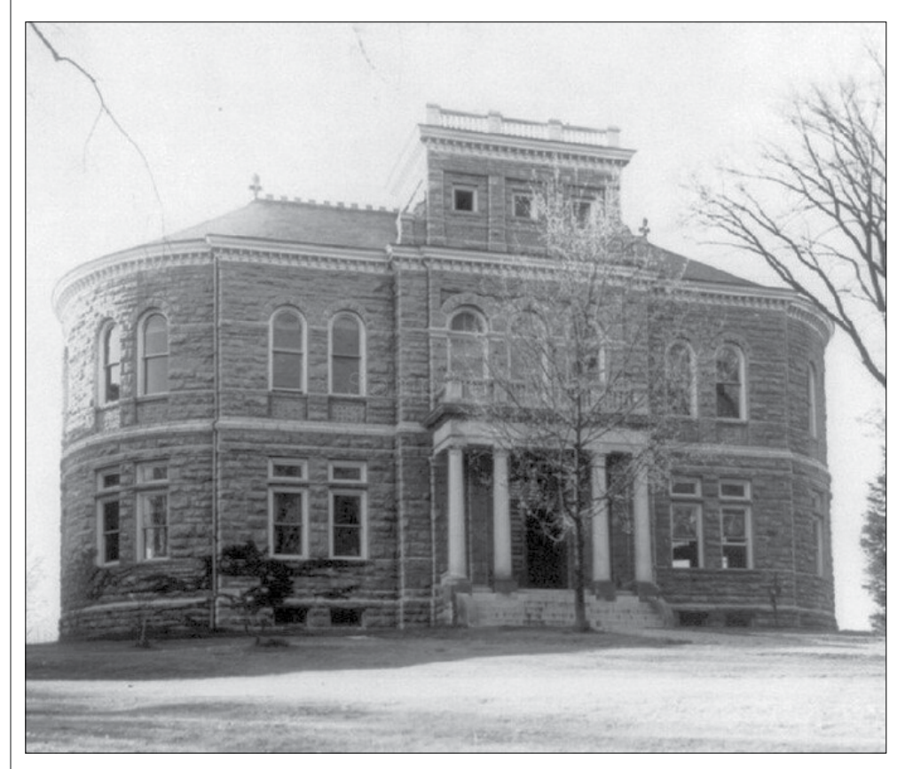
The original Tucker Hall, dedicated in 1900 and destroyed by fire in 1934.

& Irvine lumber mill in Lexington at 1:50 a.m. (What better place for an intentional fire?) In addition to the local fire department, equipment and personnel from the Washington and Lee fire brigade quickly went to the scene to help. Thus was every firefighter and piece of apparatus for miles around tied up elsewhere when the Tucker fire was called in about 3:30. When the Lexington Fire Department did get to the campus,